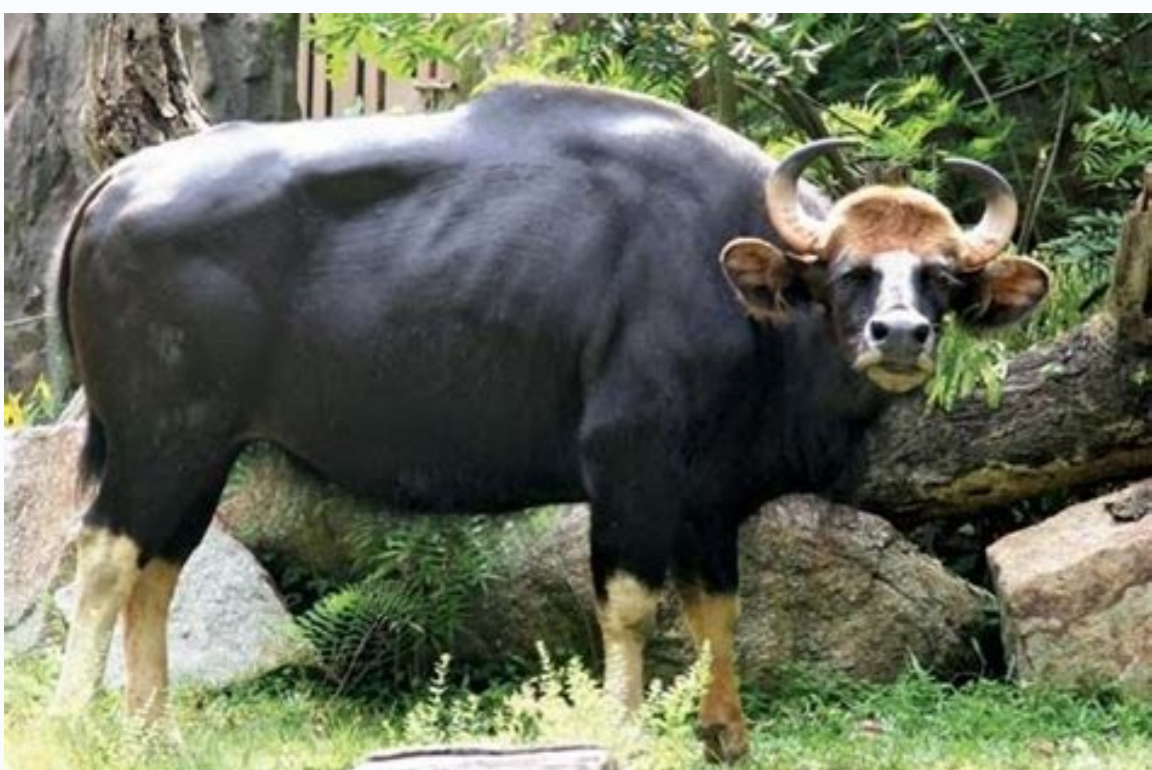
Indian buffalo animal. Buffalo animal.